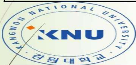
Kangwon National University