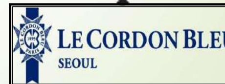
Le Cordon Bleu